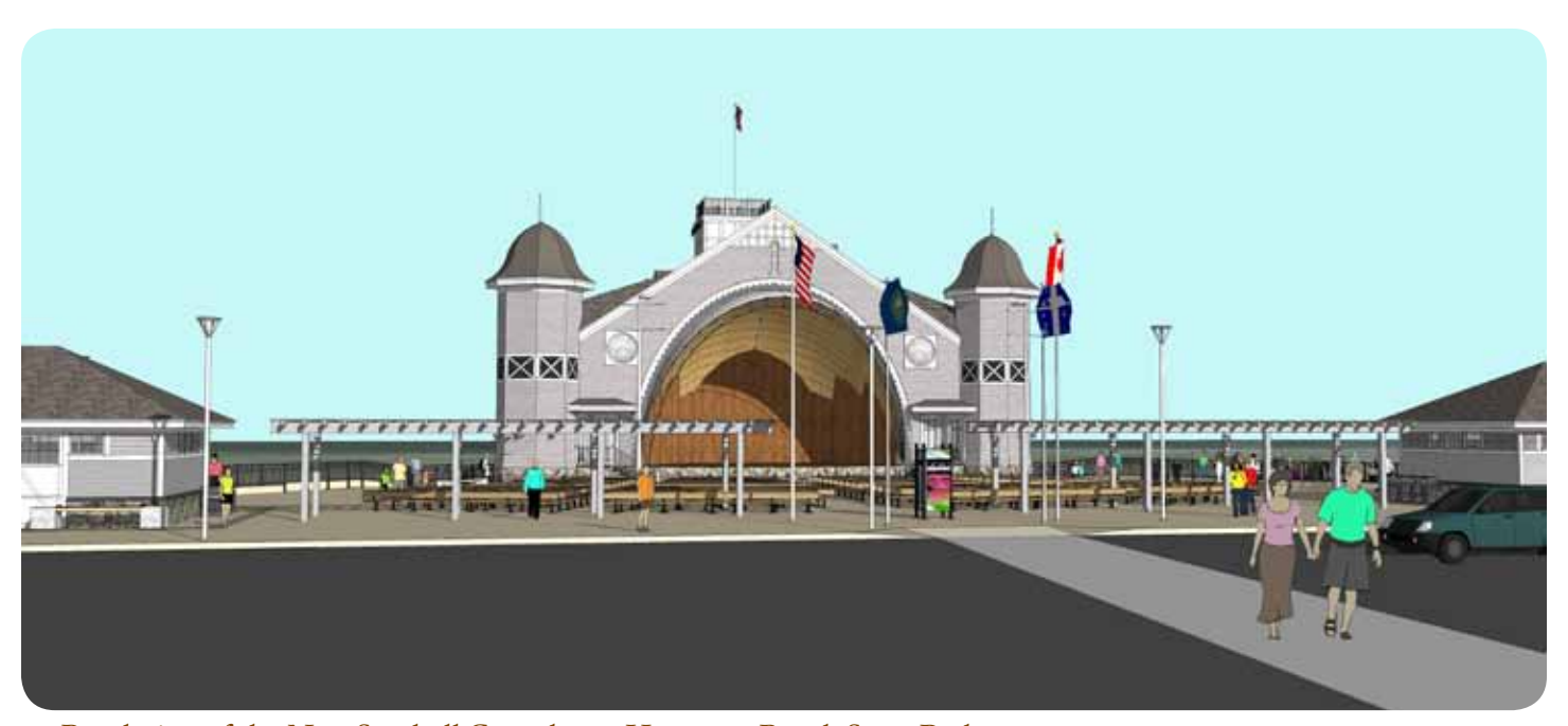
Rendering of the New Seashell Complex at Hampton Beach State Park