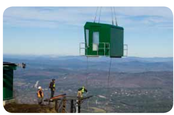
Installation of Mittersill Chairlift