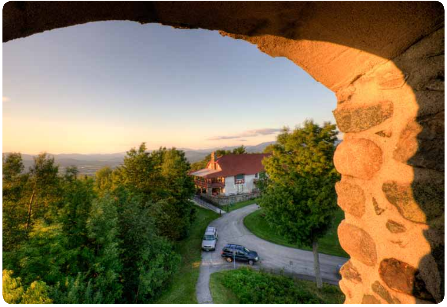
Weeks State Park

The Bureau looks forward to an equally successful year in 2011, with the completion of the afore mentioned projects, a continued strong collaborative relationship with the Division of Historical Resources, the Department of Cultural Resources, the Department of Transportation, the NH Preservation Alliance, the National Trust, as well as its sister Divisions within DRED.