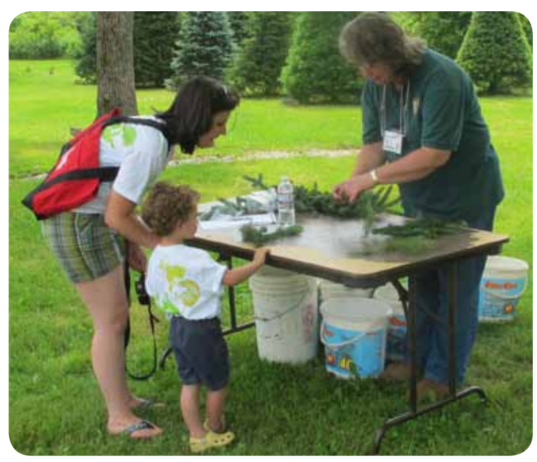
2010 Great Park Pursuit at the State Forest Nursery

The Division once again held the New Hampshire Great Park Pursuit. The goal of the program is to provide a fun way to get children and families in the outdoors and to gain awareness for New Hampshire State Parks and its recreational opportunities. The 3rd Annual New Hampshire Great Park Pursuit was kicked off at Bear Brook State Park on Saturday, June 6th. Teams signed up online, with each team having at least one child under the age of 18 and one adult over the age of 18. This year, the field was limited to 150 teams and 147 teams registered (93% NH Residents). Five weeks of events were planned, with three guided events and two self-guided events all within the state parks. Guided events were held at Bear Brook State Park, Greenfield State Park, and Wadleigh State Park; and self-guided events were held