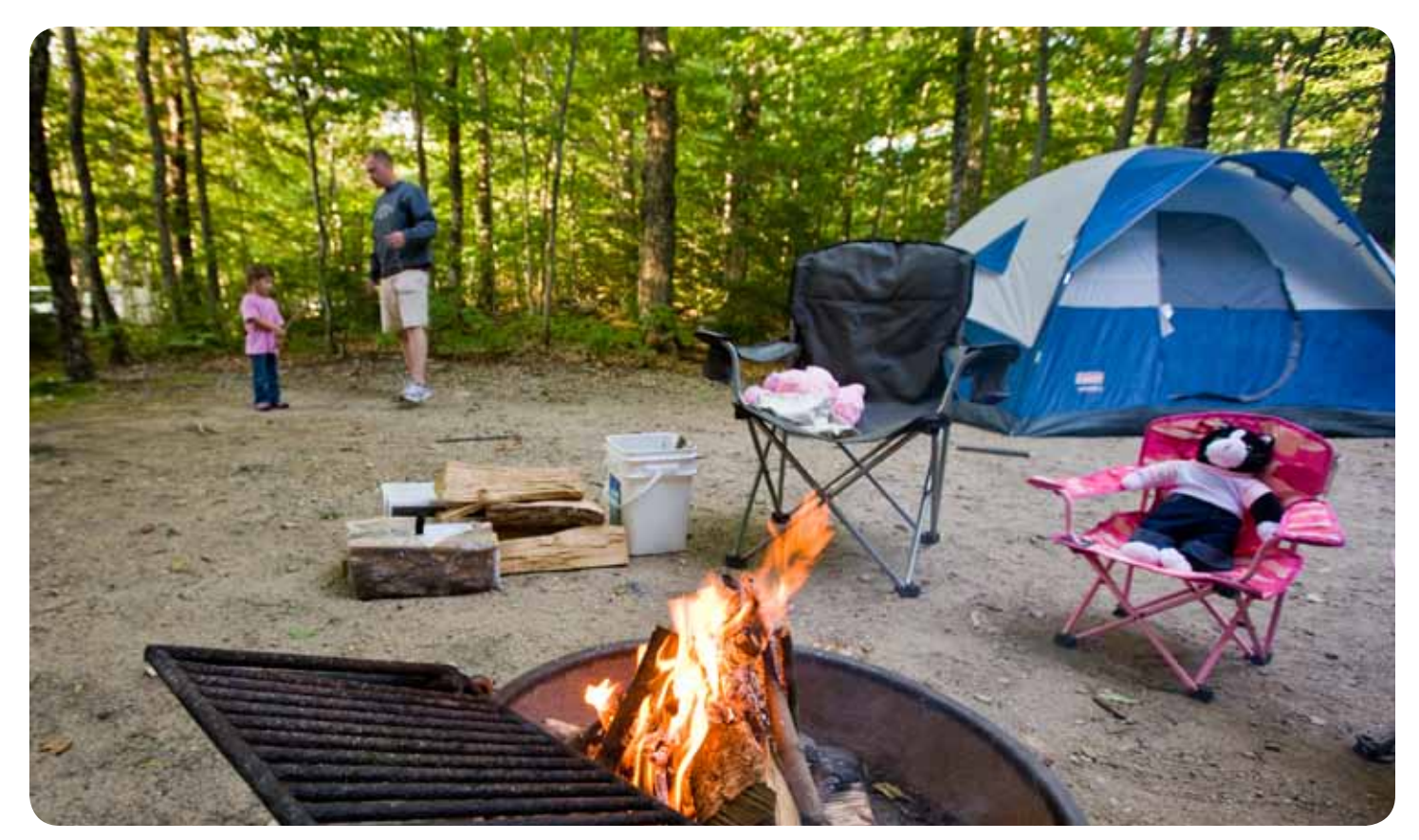
Crawford Notch State Park

Moving forward, the program is on pace to generate over $1.4 million in retail revenue for fiscal year 2011. The Division of Parks and Recreation will maintain its momentum towards continuous improvement as the Retail Program explores revenue-producing and cost-saving opportunities.