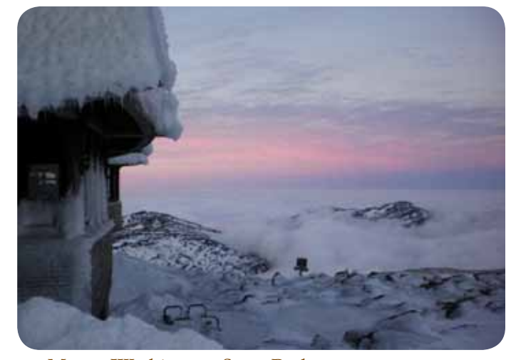
Mount Washington State Park

One hundred and forty five lives have been lost atop Mount Washington, with a hiker's fall from the Tuckerman Ravine headwall last July. Rescues on the mountain are all too common as park staff assists NH Fish and Game and other agencies in responding to hiker's calls for help. However, through the rapid and correct actions of park staff, a life was saved when a visitor to the summit suffered a cardiac arrest in August: the visitor is expected to make a full recovery.