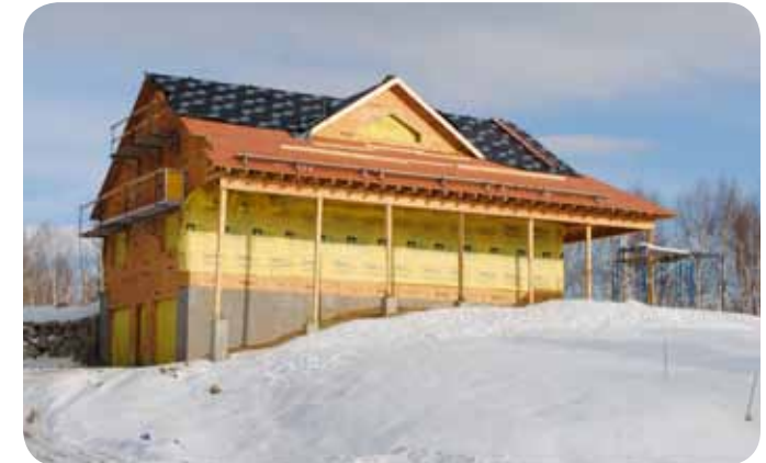
New Visitor Center at Jericho Mtn. State Park

The new Visitors Center with an information area, restrooms, offices and storage area is being built through a cooperative agreement with Berlin High School's Career and Technical Education program. This innovative and exciting agreement provides hands-on career development and trade skill training to high school students while benefiting park development. Jericho Mountain State Park was featured on WMUR's New Hampshire Chronicle in September, 2010.