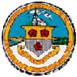
Town of Hampton