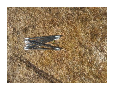
Assemble your poles!