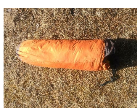
Step 2: Open your tent and lay it flat on the ground.