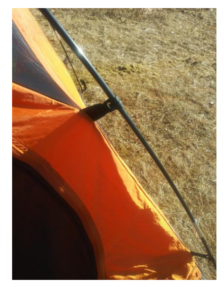
Step 5: Clip the poles into the tent and raise the tent.