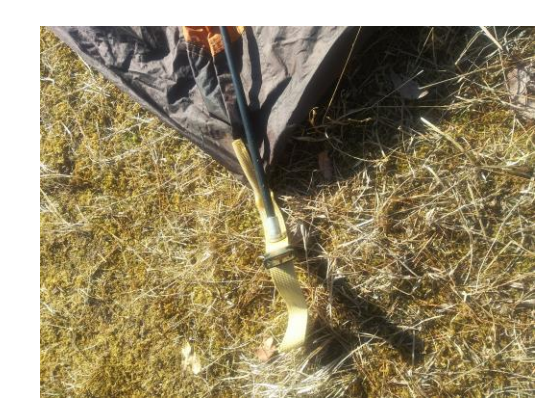
Put one end of each pole into the hole at the base of the tent.