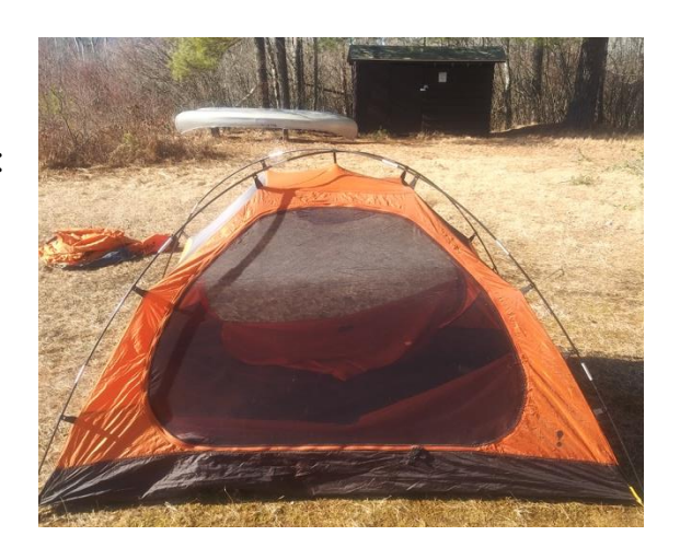
Step 7: Enjoy!