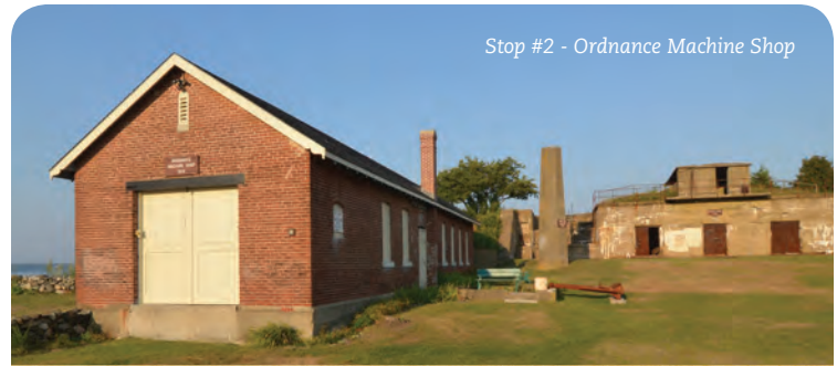
Stop #2 - Ordnance Machine Shop

11.→ During World War II in the field surrounding the flag pole (refurbished in 2008) were fourteen additional structures including quartermaster supplies, battery offices, barracks, mess halls, coal shed, first mine command offices, a fire station and a sentry booth. All the buildings were under camouflage netting supported by telephone poles to hide the buildings from potential enemy aircraft. At very low tide, you might see the remains of the Jerry's Point Lifesaving Station pier on the left. Following World War II, the Navy used Fort Stark and its Army installations for reserve training until the property was deeded to the State of New Hampshire.