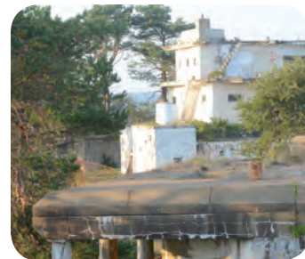
Stop #4 - Harbor Entrance Control Post