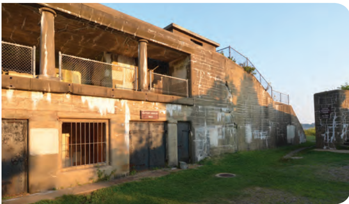
Stop #10 - Battery David Hunter

Fort Stark is a Carry in/Carry out Park. Please help keep our park clean. Pets are not permitted.