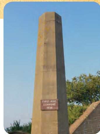
Stop #2 - a 3 story building surrounded this First Mine Command