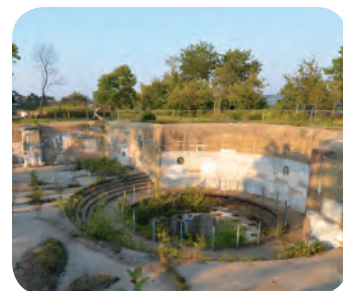
Between Stops #5 & 6 - location of 12-inch guns on Battery Hunter