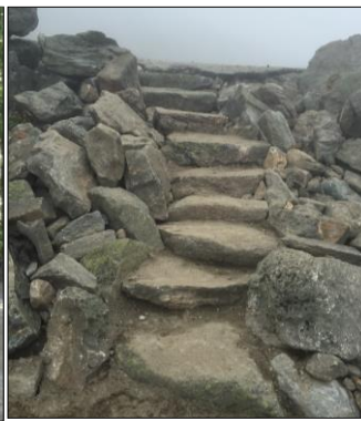
Stone Steps Mt. Washington SP