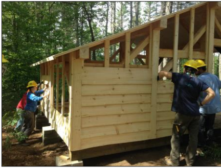
Shelter at Greenfield SP