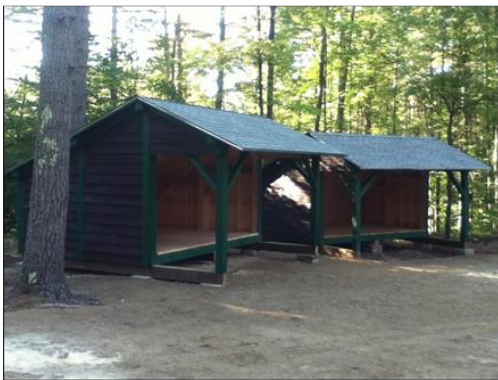
Camping Shelters Greenfield SP

During the 2015 season the SCA NH AmeriCorps Conservation Crew completed 16 hitches at various NH State Parks. In total the crews worked in 19 different State Parks and accomplished a variety of tasks from shelter building, vegetation removal, spring clean-up, stone work, trail improvements, bridge building, and painting.