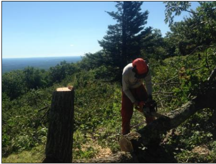
View shed clearing at Miller SP