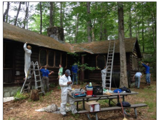
Painting office at Spruce Pond Camp