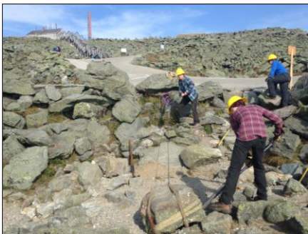
Stone Stairs at Mt. Washington SP