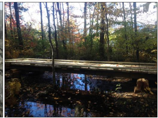
ADA-Compliant Bridge White Lake SP