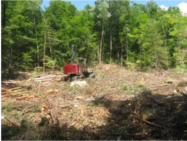
A forwarder gathers up logs in a Group Selection Cut.

Things are winding down on the Reservoir Road timber sale. The foot/ski path, which runs from the ATV/Snow-machine Trail to Reservoir Road, has been re-opened. All cutting and forwarding was completed earlier this week and trucking of logs will be completed soon. Once all the logs have been trucked the log yard will be smoothed, seeded and mulched.