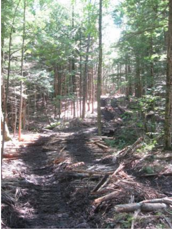
A forwarder trail. Logging slash (like tree limbs) has been placed in the trail.