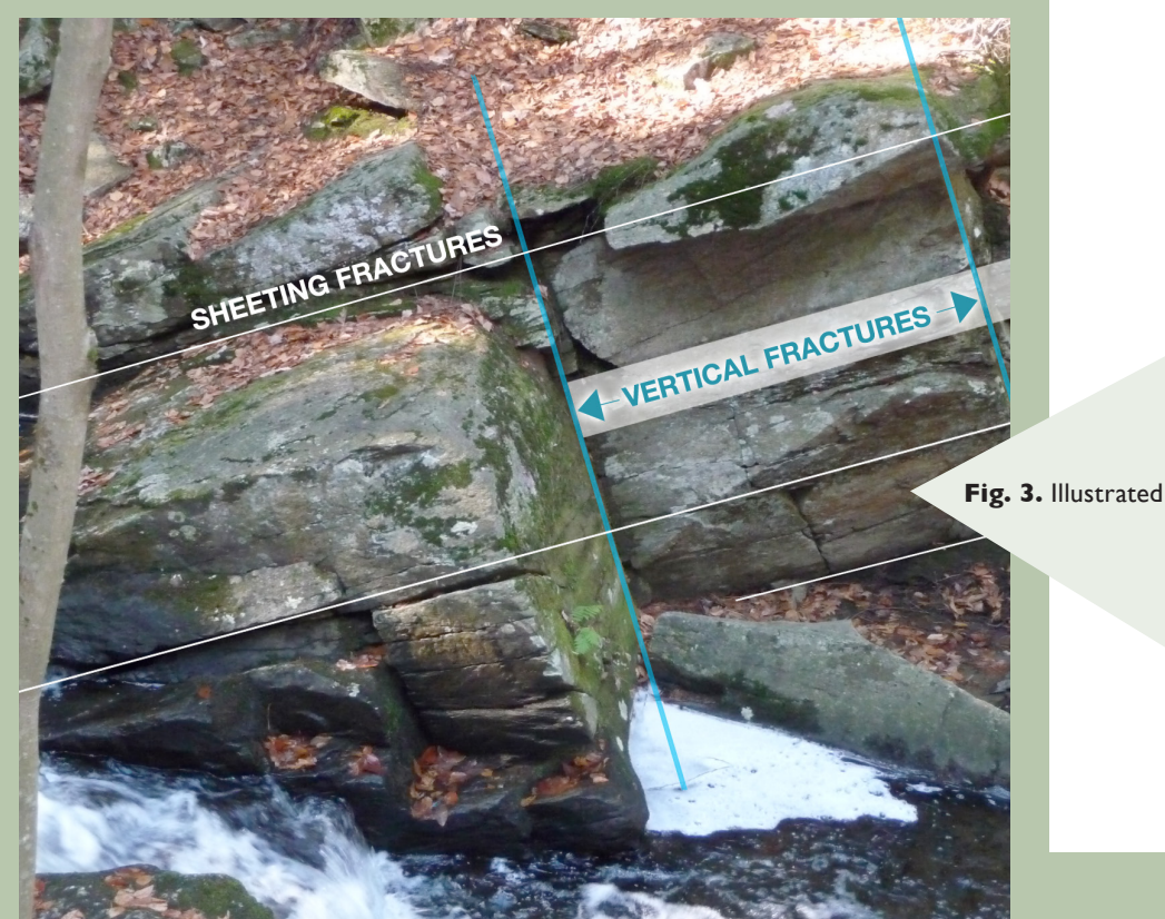
Fig. 3. Two sets of vertical fractures, intersecting the horizontal sheeting fractures.

The sheeting fractures are intersected at near right angles by vertical fractures (Fig. 3), the result of even older geologic stresses in the granodiorite.