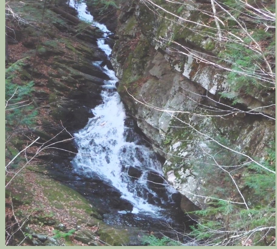
Fig. 2. Sheeting fractures dipping southwest (to the right) in the stream channel.

During the 180 million years since the break-up of Pangaea, weathering and erosion have worn down the Appalachians, removing hundreds of feet of overlying rock and exposing this granodiorite. The erosion of all that overlying rock removed a lot of weight. This "weight loss" caused the granodiorite to crack parallel to the land surface. Geologists call all such cracks – bedrock fractures. These near horizontal fractures are known specifically as sheeting fractures (Fig.2). At Chesterfield Gorge, they can be seen to slope slightly downward to the southwest... toward NH Route 9.