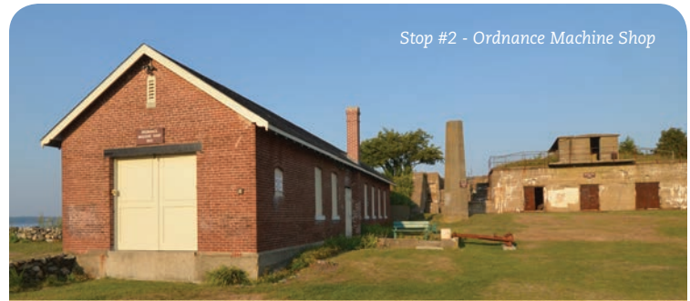
Stop #2 - Ordnance Machine Shop

11.→ During World War II in the field surrounding the flag pole (refurbished in 2008) were fourteen additional structures including quartermaster supplies, battery offices, barracks, mess halls, coal shed, first mine command offices, a fire station and a sentry booth. All the buildings were under camouflage netting supported by telephone poles to hide the buildings from potential enemy aircraft. At very low tide, you might see the remains of the Jerry's Point Lifesaving Station pier on the left. Following World War II, the Navy used Fort Stark and its Army installations for reserve training until the property was deeded to the State of New Hampshire.