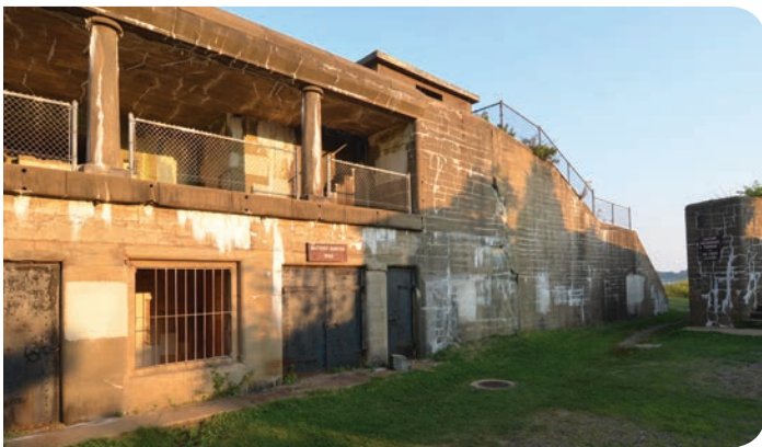
Stop #10 - Battery David Hunter

Fort Stark is a Carry in/Carry out Park. Please help keep our park clean. Pets are not permitted.