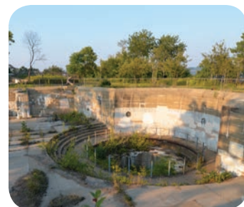
Between Stops #5 & 6 - location of 12-inch guns on Battery Hunter