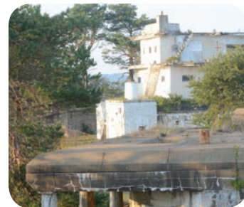
Stop #4 - Harbor Entrance Control Post