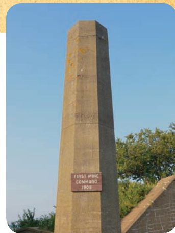
Stop #2 - a 3 story building surrounded this First Mine Command