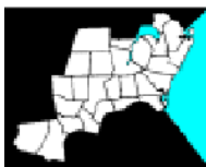
Rockingham Planning Commission