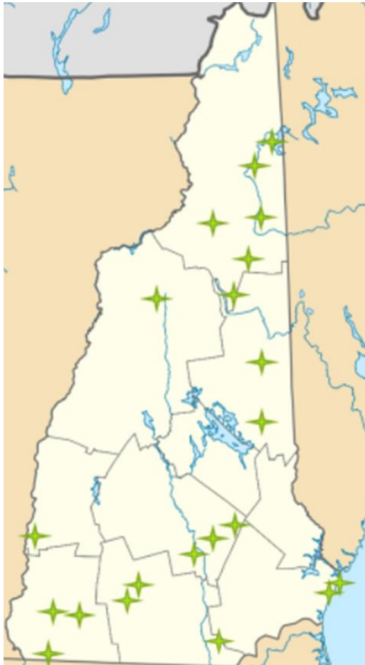
Approximate project locations