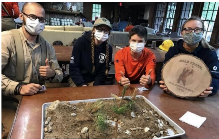
Trails Skills Derby – an SCA classic! Last day of trails training when crews construct mini trail networks to put their new trail knowledge to the test.