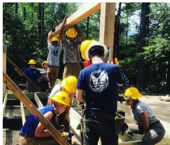
Carpentry Training at Greenfield State Park. Members construct the frame for a camping shelter.