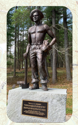
CCC Worker Statue