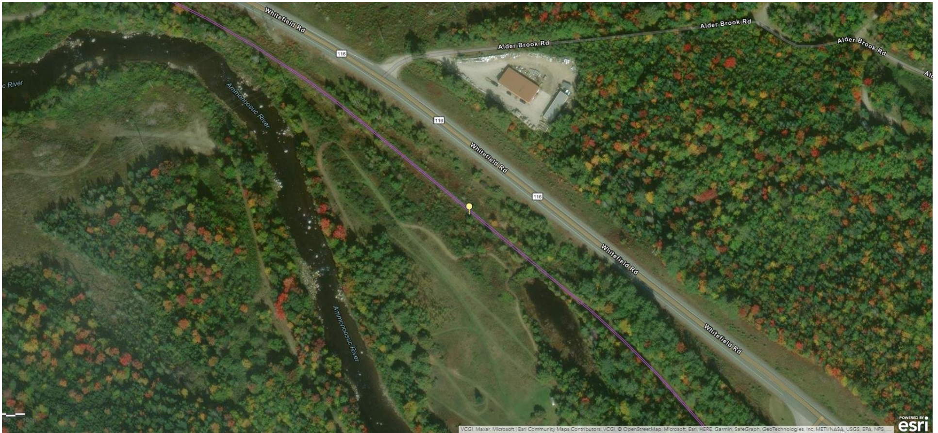
Map of Project Area 3

Close up of previous map showing end point of abandonment on trail. Do not remove any rails or ties beyond the endpoint marked on this map. At mandatory pre-construction meeting this location will be shown to contractor and marked in field.