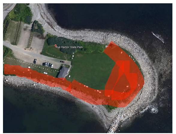
Debris removal area highlighted in RED

The removal of storm debris over 2 acres at Rye Harbor State Park, Ragged Neck Picnic Area. Debris will be removed from the lawn and relocated to the existing shoreline.