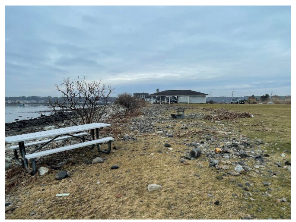
Debris at Rye Harbor State Park