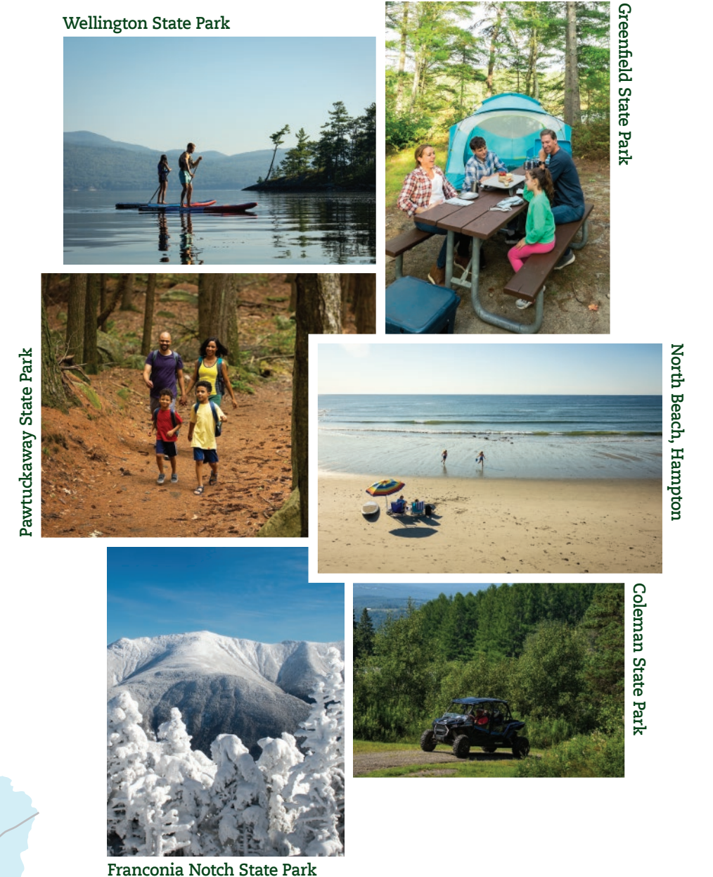
Wellington State Park