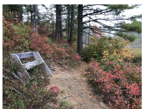
Cutting back and maintenance of the Hogback trail at Greenfield State Park by volunteer Bob Beck