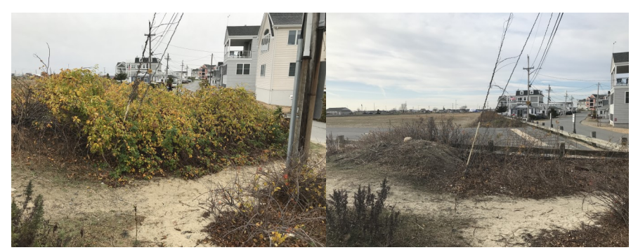
Before and after of bittersweet invasive removal at South Beach State Park by volunteer Karla Sorenson