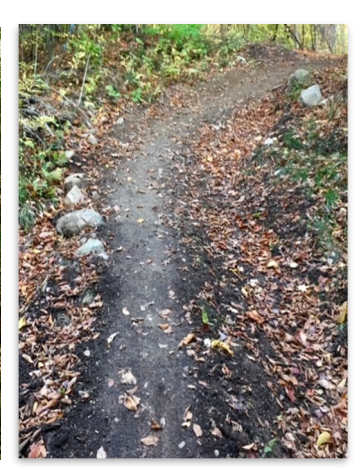
Rebuild of the CCC Perimeter Loop trail at Moose Brook State Park by the Coos Cycling Club