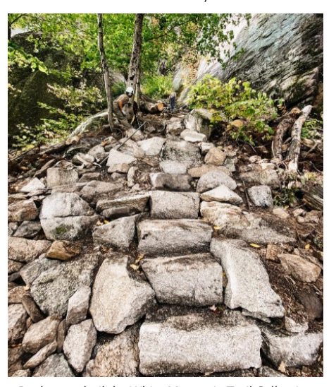
Rock steps built by White Mountain Trail Collective and partner crews at Cathedral Ledge State Park throughout the summer of 2020