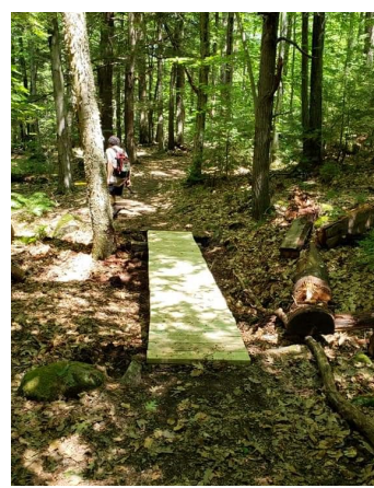
Bridge built by Southern NEMBA on the chipmunk trail at Bear Brook State Park