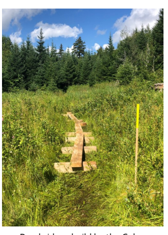
Bog bridges build by the Cohos Trail Association