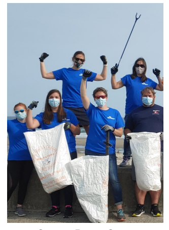
Sprague Energy Group volunteering with Blue Ocean Society at Wallis Sands State Park