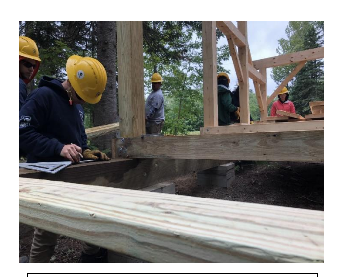
Carpentry Training at Umbagog State Park. Members construct the frame for a camping shelter.

The program dives right into training season to prepare members for the field. Through a combination of formal training and certification courses, hands-on field instruction on real-time projects, and supervised follow-up training, members go through nearly two months of skill development prior to the start of the regular hitches. Most of this happens as a training-through-service model, as the bulk of training is spent completing projects on public lands.