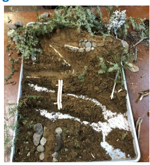
Trails Skills Derby – an SCA classic! Last day of trails training when crews construct mini trail networks to put their new trail knowledge to the test.